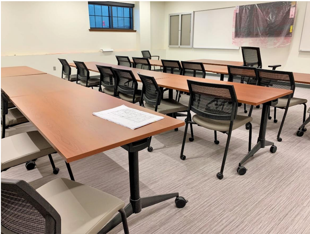
Caption: Police Department Briefing Room, still under construction, with tables, chairs, dry erase boards, and various technology to assist the Department with assignments, presentations, and to disseminate information. Photo taken Friday, January 13, 2023.

Note: To subscribe to the Public Safety Building Project e-mail notifications, use this link to enter your email address, and select “Public Safety Building” from the list of options.