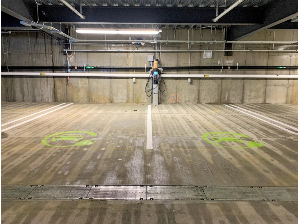
Caption: Two parking spaces and charging station designated for electric vehicles in the underground garage, taken on Friday, January 13, 2023.