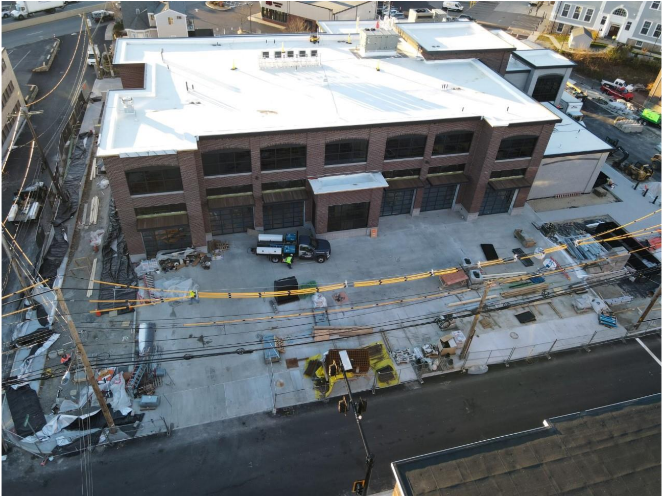
Caption: Photo of the active construction site via drone on Monday, November 21, 2022 facing the west side of the building along Bryant Street.

Note: To subscribe to the Public Safety Building Project e-mail notifications, use this link to enter you email address, and select “Public Safety Building” from the list of options.