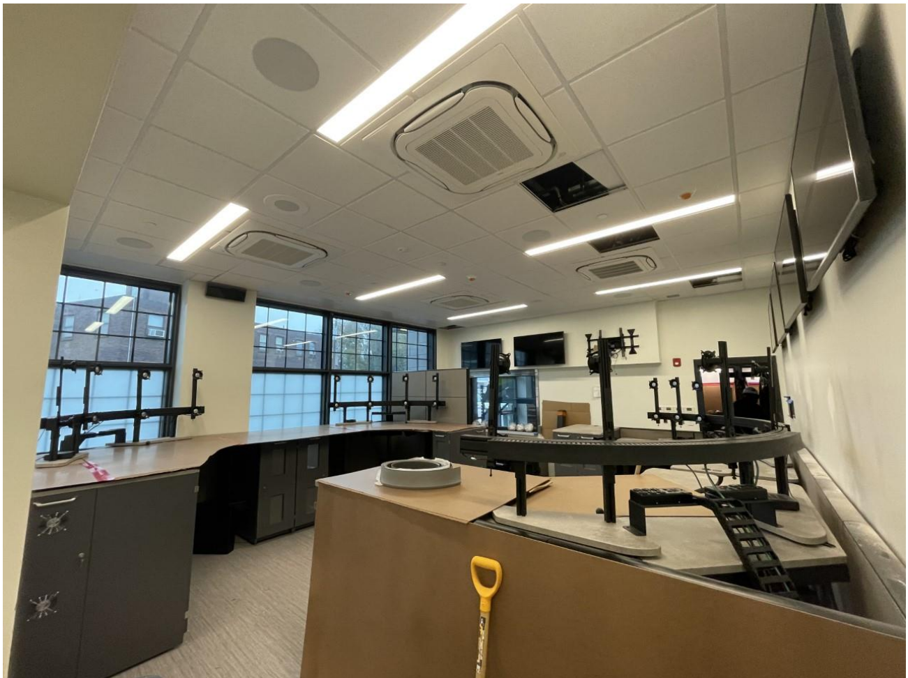
Caption: Interior photo of the new Dispatch Center and workstations currently being installed, taken on Wednesday, November 16, 2022.

Note: To subscribe to the Public Safety Building Project e-mail notifications, use this link to enter your email address, and select "Public Safety Building" from the list of options.