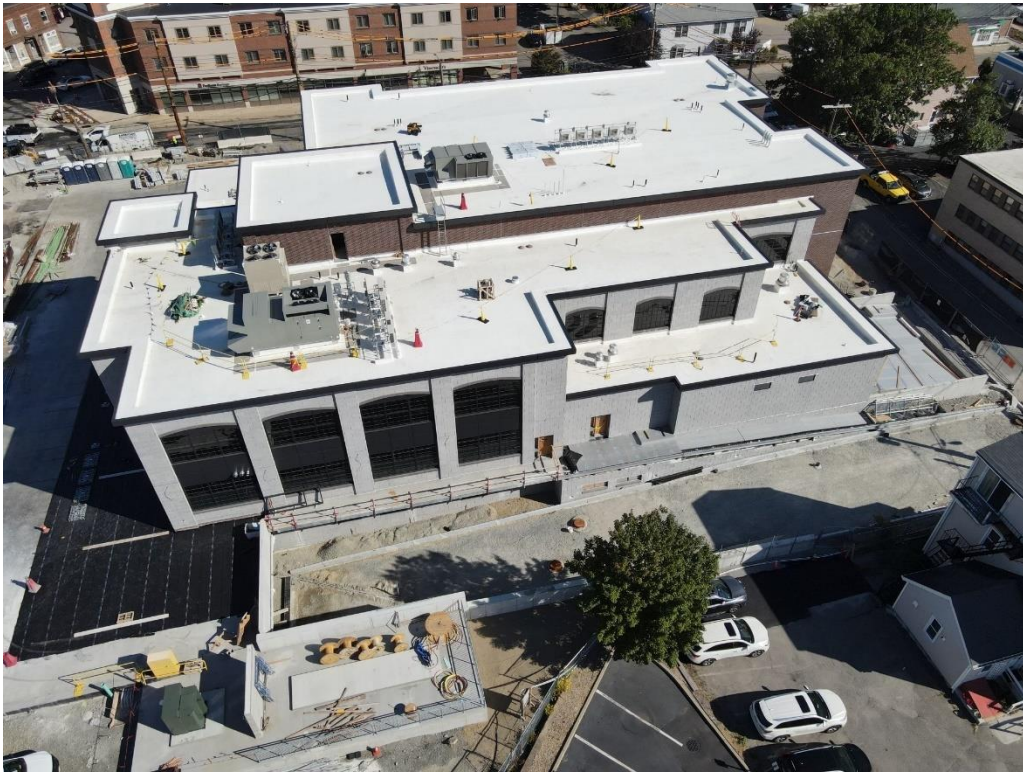
Caption: Aerial photo of active construction site taken via drone on Monday, August 22, 2022.

Note: To subscribe to the Public Safety Building Project e-mail notifications, use this link to enter you email address, and select “Public Safety Building” from the list of options.