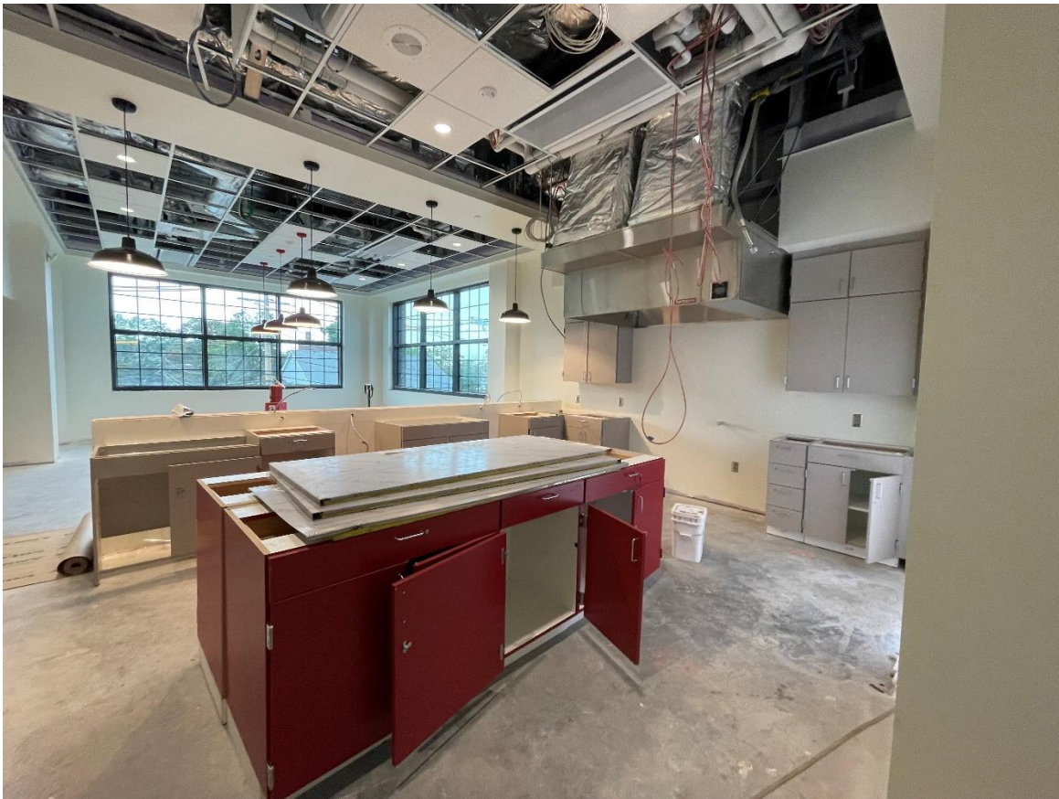
Caption: Photo of the cabinetry under construction within the Fire Station kitchen, taken on Thursday, August 11, 2022.

Note: To subscribe to the Public Safety Building Project e-mail notifications, use this link to enter you email address, and select "Public Safety Building" from the list of options.