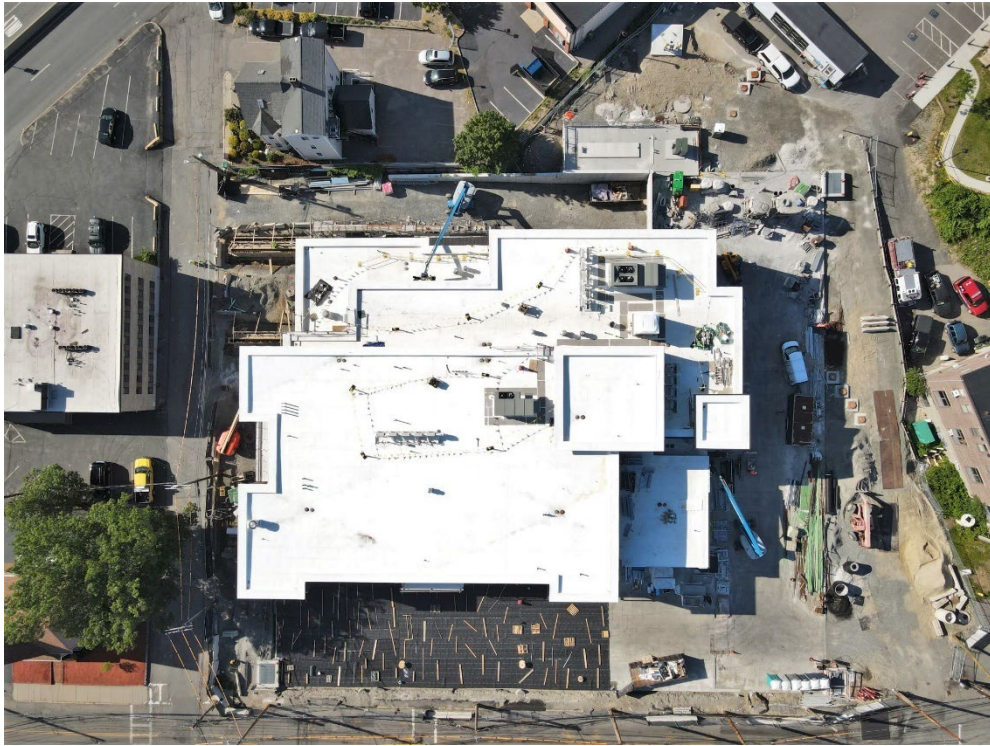
Caption: Aerial photo of the project site taken via drone on June 23, 2022. (North is located to the left of the photo).

Note: To subscribe to the Public Safety Building Project e-mail notifications, use this link to enter you email address, and select “Public Safety Building” from the list of options.