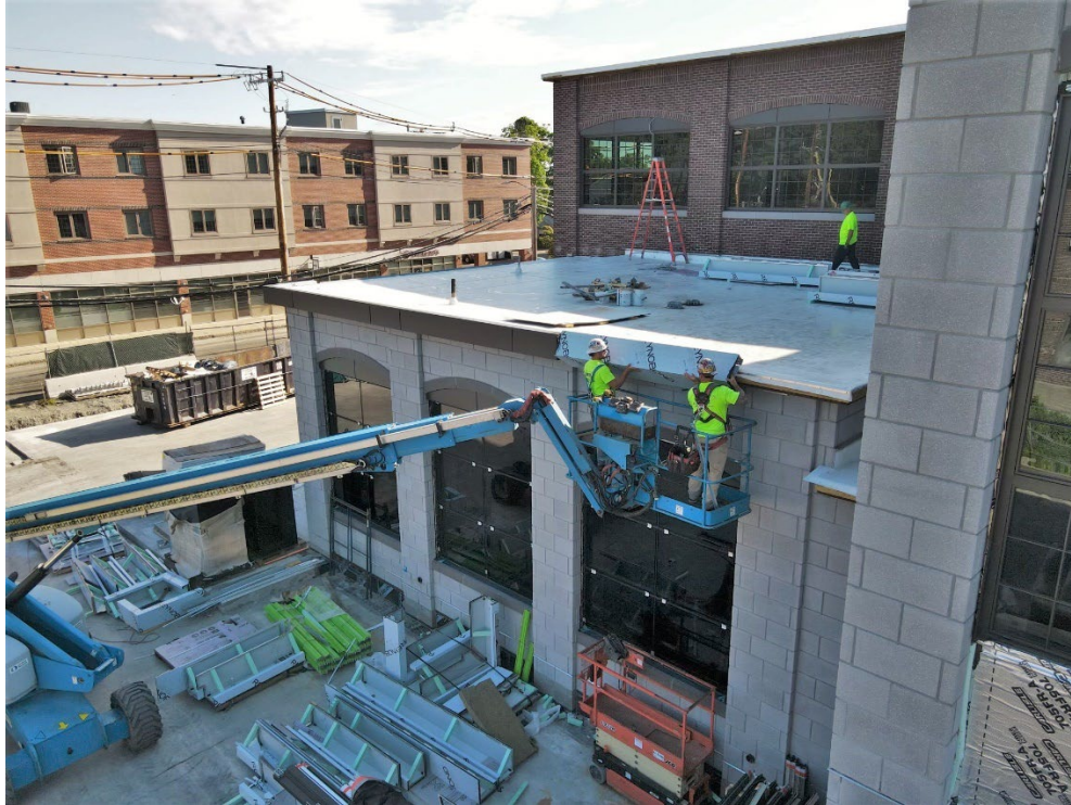
Caption: Photo of crews installing the parapet cap along the southern roof edge, taken by drone on June 23, 2022. Parapet caps help to create a uniform, finished look and prevent intrusion of water.

Note: To subscribe to the Public Safety Building Project e-mail notifications, use this link to enter you email address, and select “Public Safety Building” from the list of options.