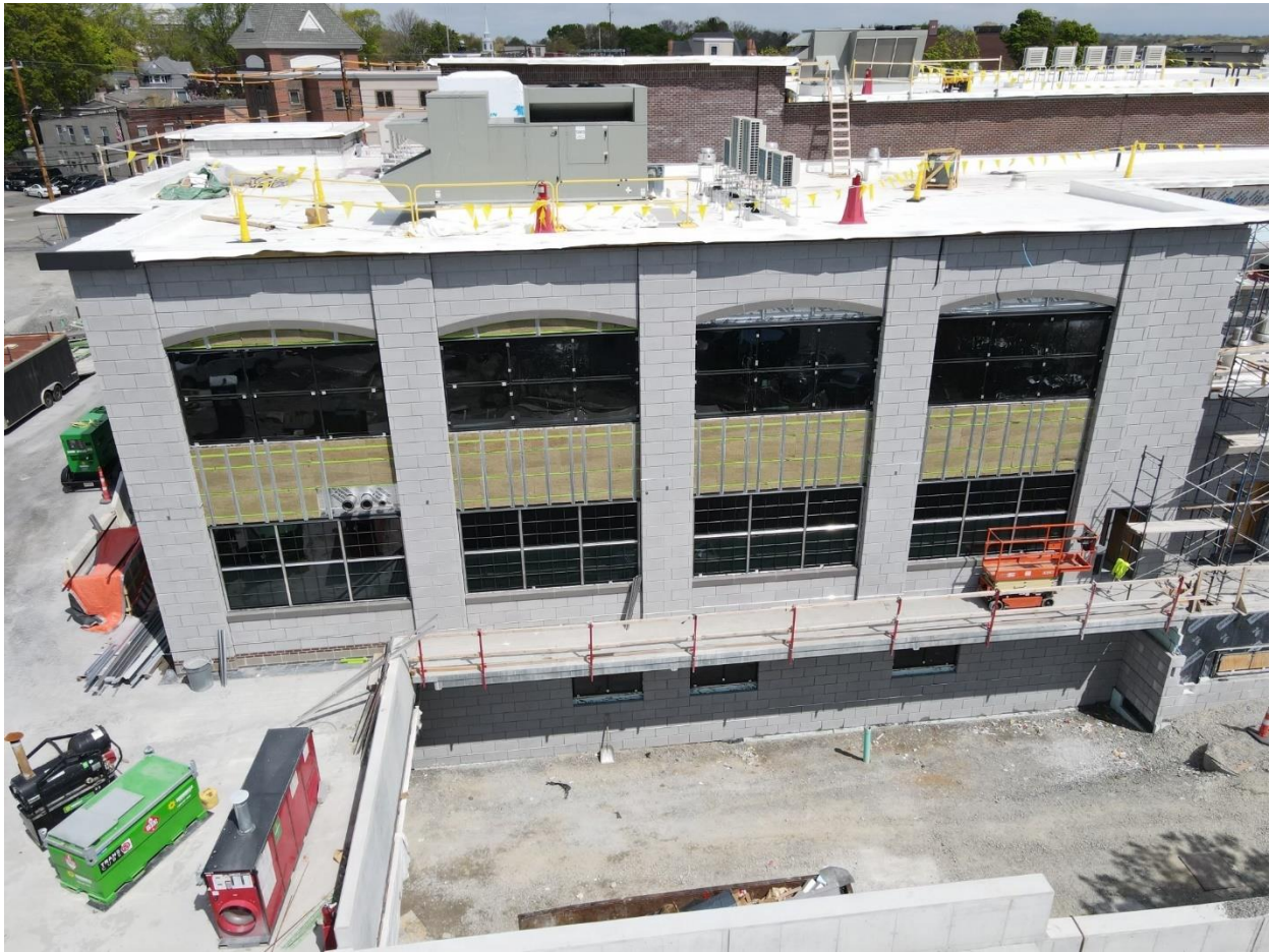
Caption: Photo of the exterior of the south/southeast side of the building, taken by done on Friday, May 13, 2022. The grey stone exterior, known as Shouldice, is being installed along the exterior of the Police Station portion of the new building. The staging, as shown to the right in this photo, will be removed as the exterior stonework is completed.

Note: To subscribe to the Public Safety Building Project e-mail notifications, use this link to enter you email address, and select “Public Safety Building” from the list of options.