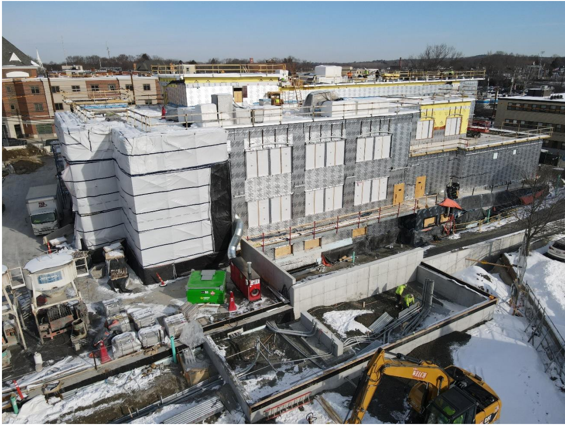
Caption: Aerial photo of the east side of the building using a drone on Wednesday, February 16, 2022.

Note: To subscribe to the Public Safety Building Project e-mail notifications, click here to provide your name and email address.