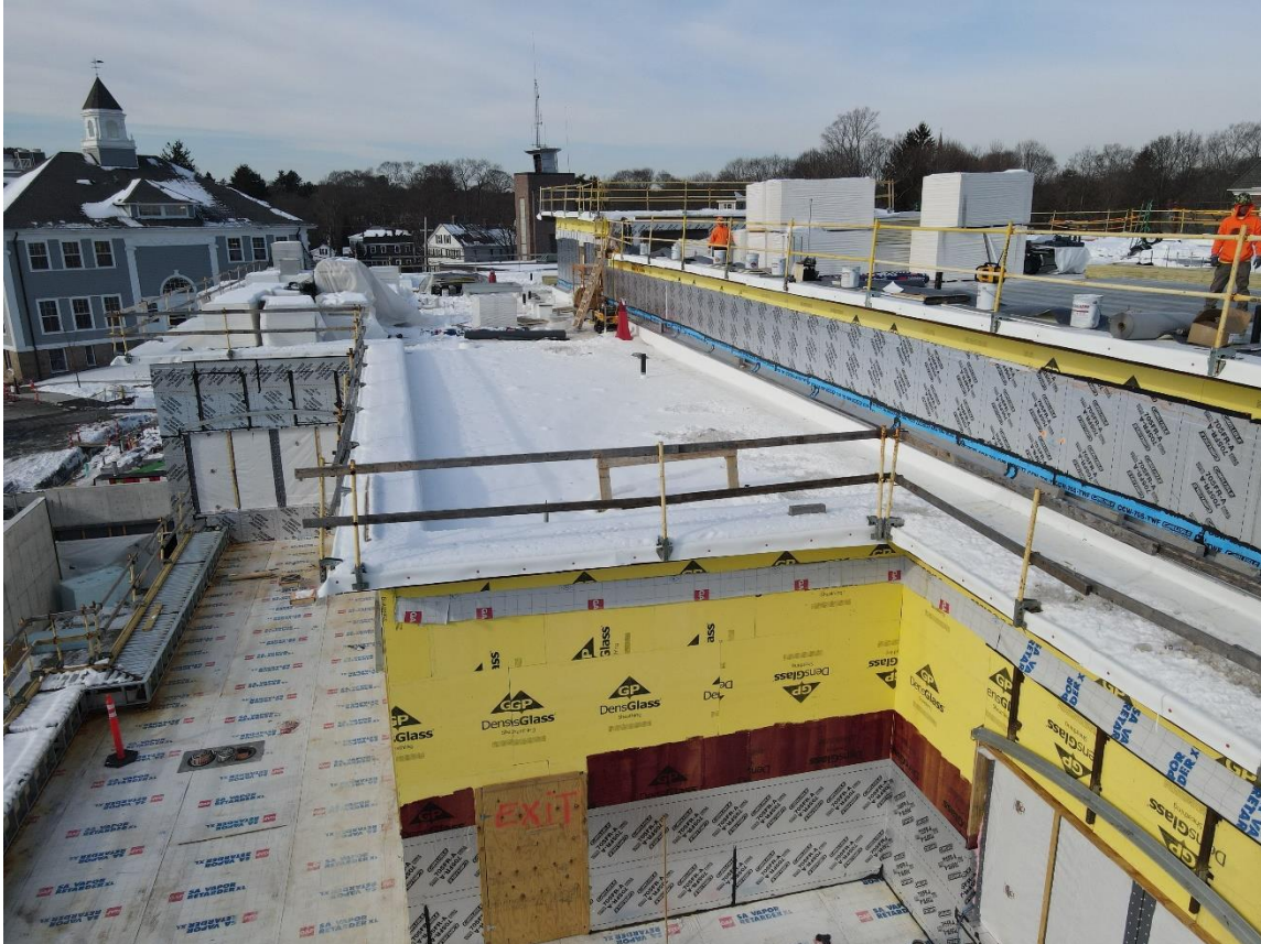
Caption: Photo of the roof installation underway taken using a drone on Wednesday, February 16, 2022.

Note: To subscribe to the Public Safety Building Project e-mail notifications, click here to provide your name and email address.