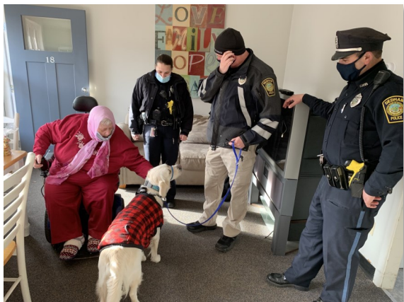
Officers and Ruby visit residents on Parkway Court

Sidewalk Parking Violations: Parked vehicles obstructing sidewalks is a concerning issue in the Town of Dedham. Vehicles which obstruct sidewalk walking surface areas force pedestrians to walk around vehicles, generally onto roadway areas. This is not a safe practice. Parking on sidewalks is a violation of the Town's Traffic Regulations, section 5-1. Officers will be monitoring parking throughout Town and looking for vehicles which obstruct sidewalks. Parked vehicles must provide at least 4 feet, preferable 5 feet of walking surface for pedestrians to safely pass by. Avoid a ticket and be a good neighbor. Please park legally and appropriately.