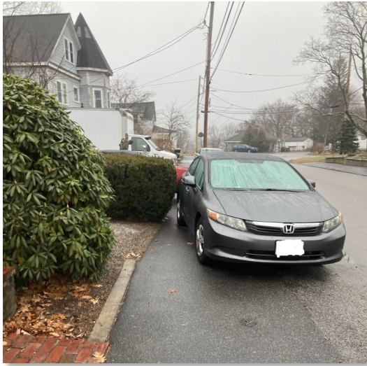
Example of a parking violation. The car is parked obstructing access to the sidewalk.