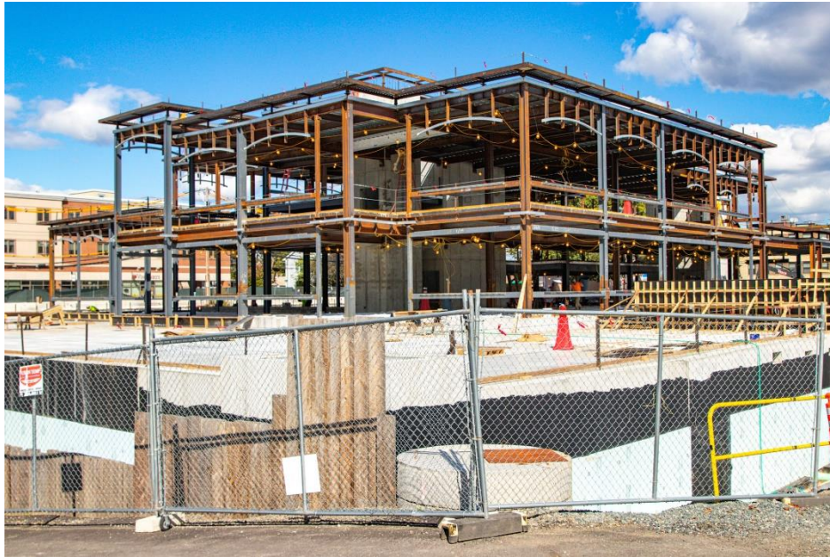
Caption: Photo of active construction site taken from the north side of Town Hall on Friday, October 1, 2021.