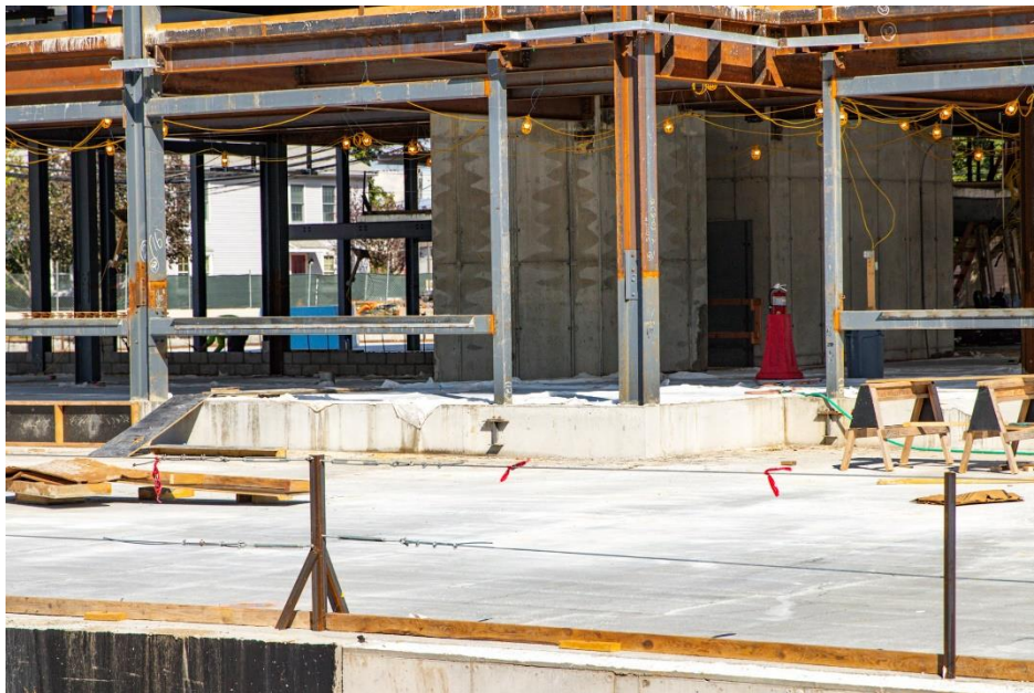
Caption: Photo taken on Friday, October 1, 2021 of a section of the concrete slab on the second floor.

Note: To subscribe to the Public Safety Building Project e-mail notifications, click here to provide your name and email address.