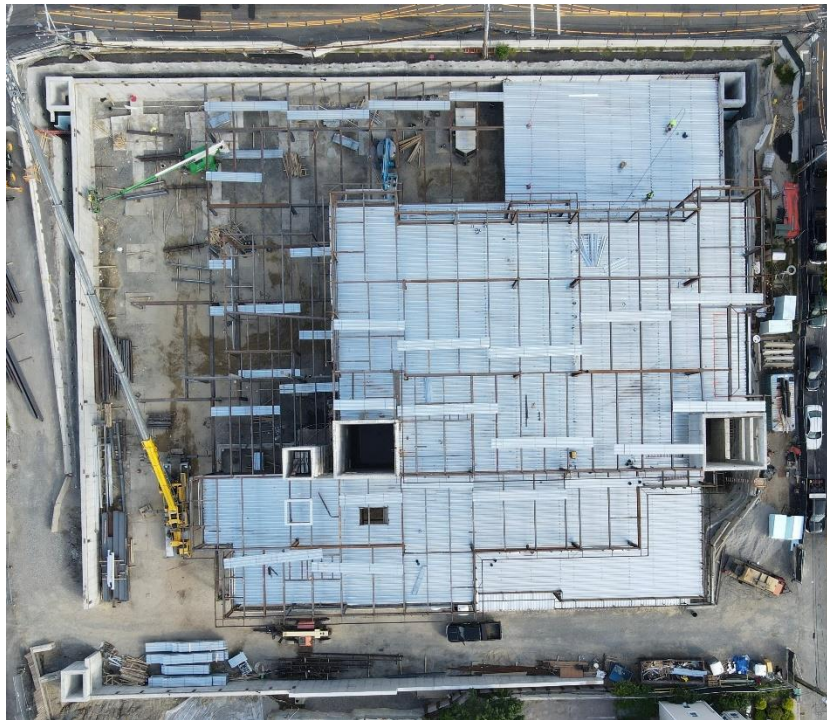
Caption: Before and After: Top photo taken with drone on April 9, 2021 and bottom photo taken with drone on August 18, 2021. Visit the project website to use the image slider and view the construction progress.

Note: To subscribe to the Public Safety Building Project e-mail notifications, click here to provide your name and email address.