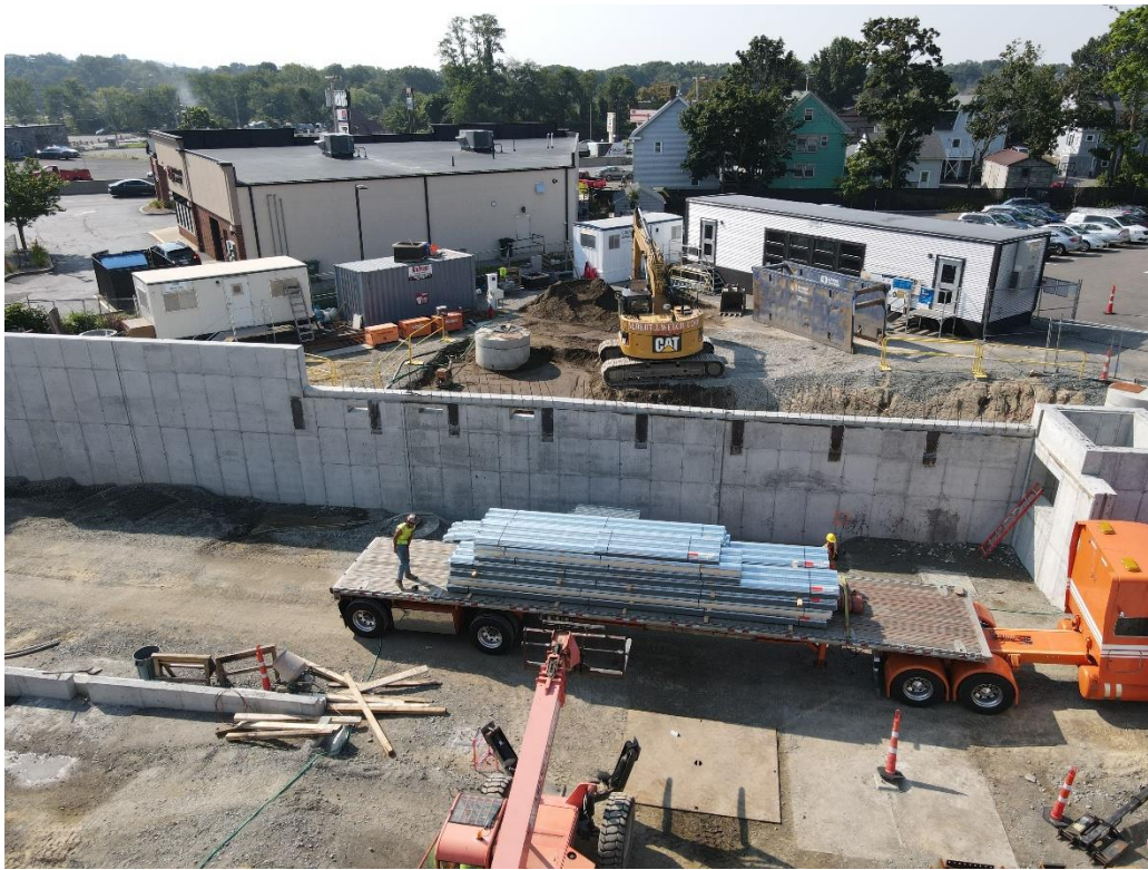
Caption: Drone photo of the project site taken on July 27, 2021, looking south. Installation of the concrete foundation walls are underway, and a delivery of metal decking is shown at the center of the photo.