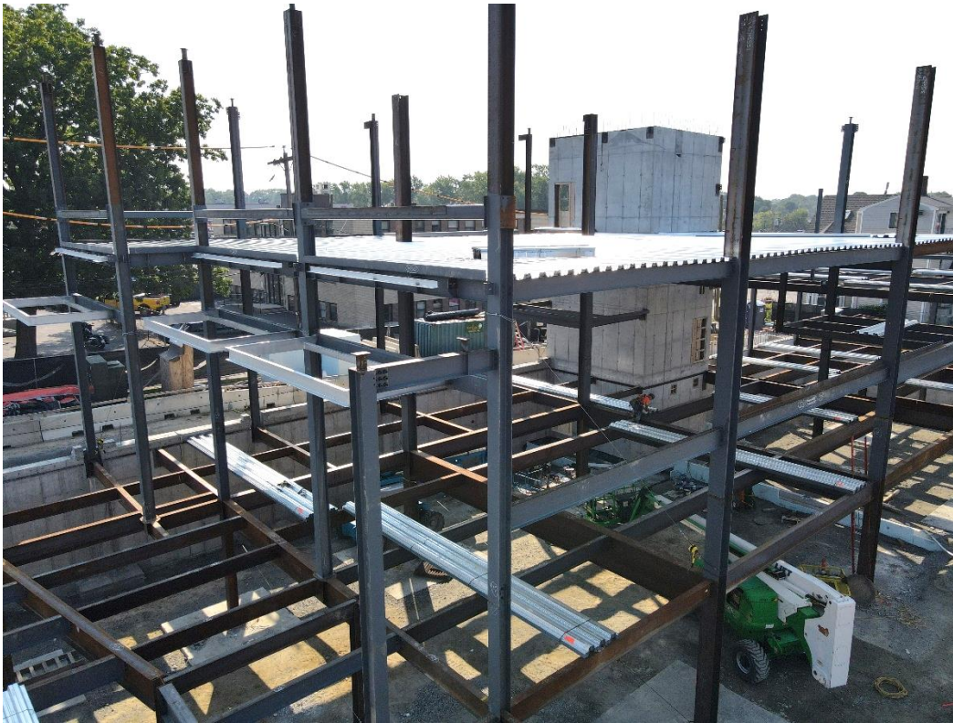
Caption: Aerial photo of construction site on July 28, 2021, by drone to show the detail of structural steel and metal decking installed onsite. To date, more than 400 individual pieces of steel have been installed.

Note: To subscribe to the Public Safety Building Project e-mail notifications, click here to provide your name and email address.