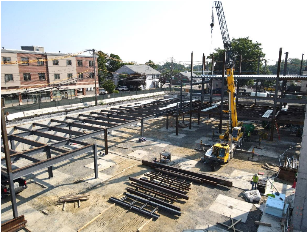
Caption: Aerial photo of the project site taken on July 27, 2021. The yellow crane to the right is used to raise and place each individual piece of structural steel that is secured into position.