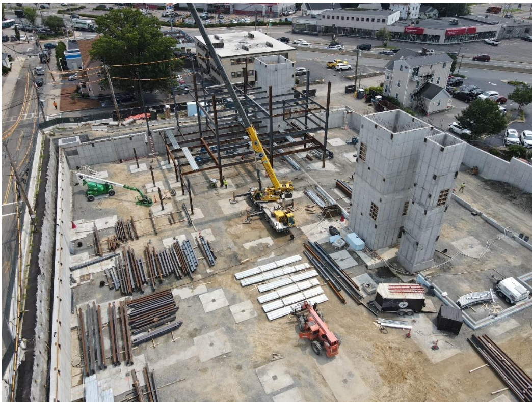
Caption: Aerial photo of construction site on July 21, 2021. A crane is used to raise and place each piece of steel, one a time, for installation by onsite crew members. Pieces of steel are being delivered to the site and securely stored along the west and south walls, shown at the left of this photo.

Note: To subscribe to the Public Safety Building Project e-mail notifications, click here to provide your name and email address.