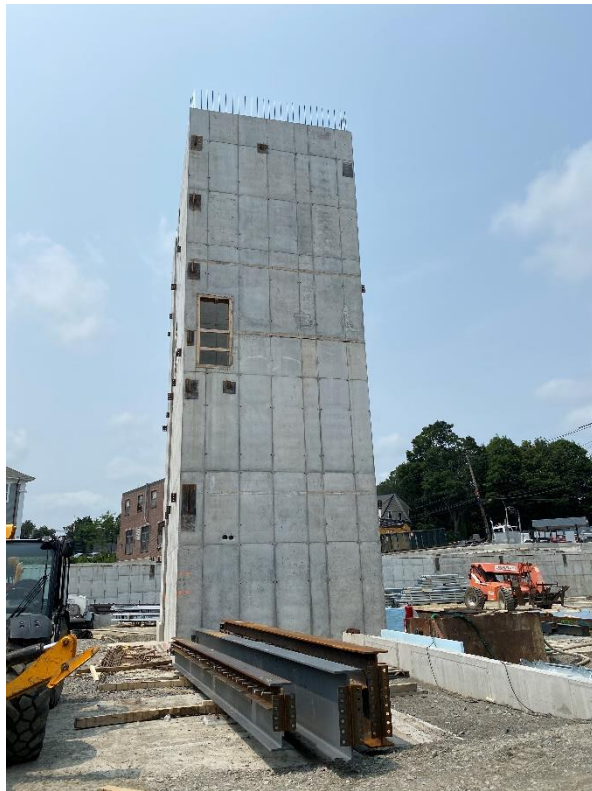
Caption: Photo taken from ground level of the project site facing Stairwell #1, looking south.