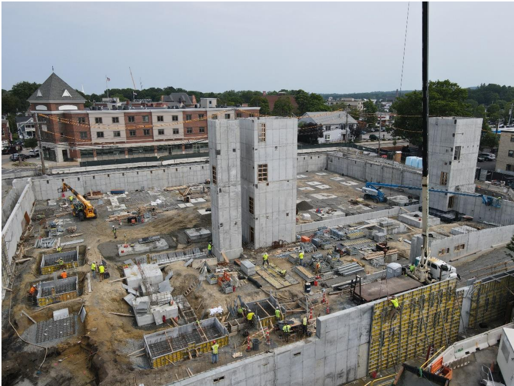
Caption: Aerial photo of construction site take on July 6, 2021. The concrete structures shown (3 in total) are the two stairwells and one elevator shaft.