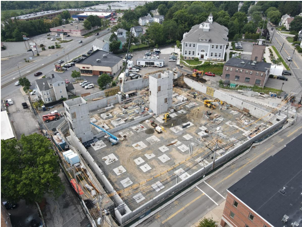
Caption: Aerial photo of construction site taken on July 6, 2021. The newly renovated Town Hall/Senior Center is shown in the background with Route 1 South to the left. The grey squares throughout the project site are the concrete foundation footings, completed as of Friday, July 9, 2021.

Note: To subscribe to the Public Safety Building Project e-mail notifications, click here to provide your name and email address.