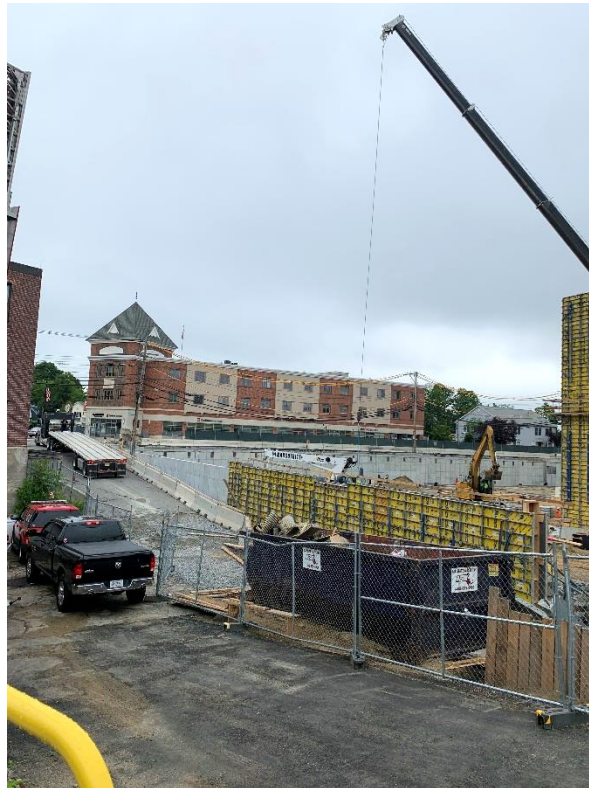
Caption: Photo of crews building the west wall of the public safety building (in yellow), taken from north side of Town Hall on Friday, June 25, 2021.

Note: To subscribe to the Public Safety Building Project e-mail notifications, click here to provide your name and email address.