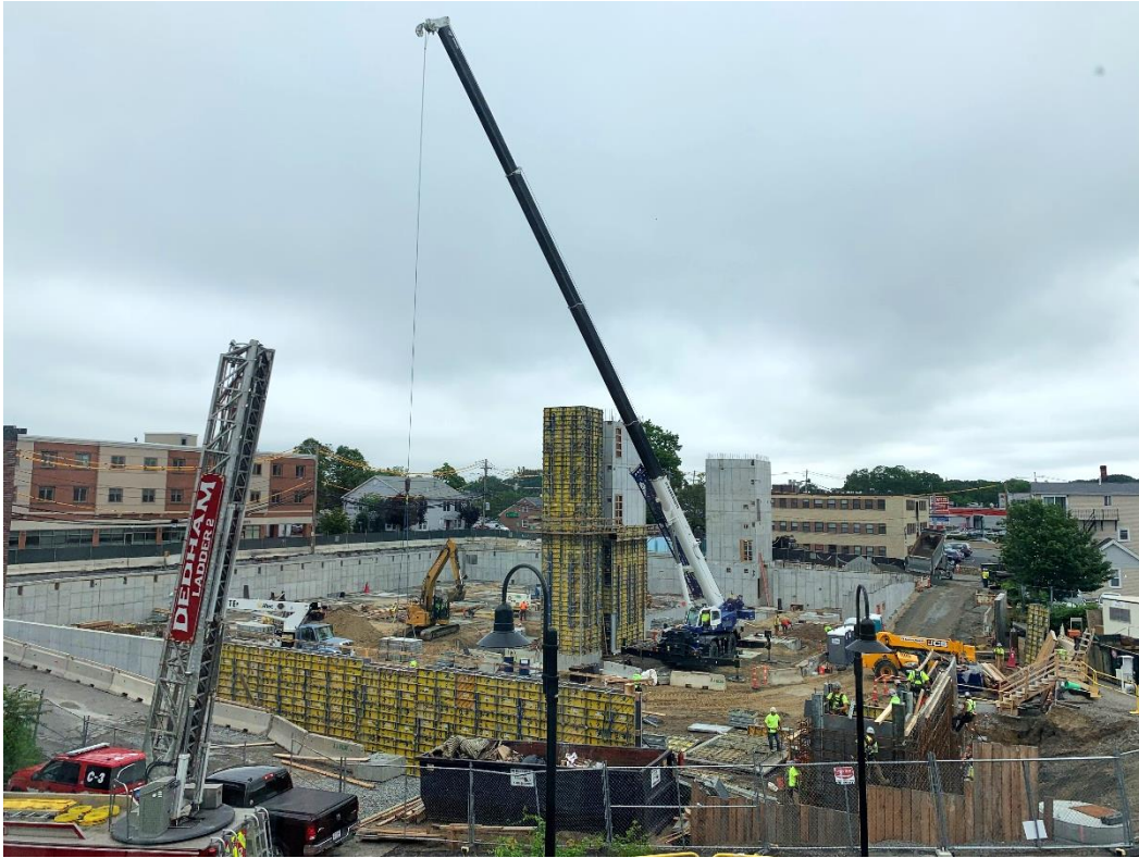
Caption: Photo of construction site taken from north side of Town Hall on Friday, June 25, 2021.