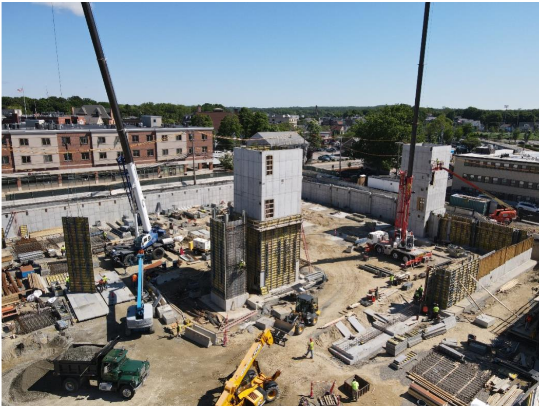
Caption: Aerial image of site, taken on Wednesday, June 16, 2021. Each piece of the elevator shear walls lifted and installed into place by cranes, as shown to the left in the photo.

Note: To subscribe to the Public Safety Building Project e-mail notifications, click here to provide your name and email address.