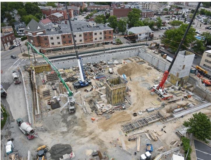
Caption: Aerial image of site, facing northeast, taken on Thursday, June 3, 2021. Stairwell #1 is in the center of the photo and is currently under construction.

Note: To subscribe to the Public Safety Building Project e-mail notifications, click here to provide your name and email address.