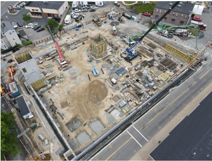
Caption: Aerial image of site, facing south, taken on Thursday, June 3, 2021. Stairwell #2 and stairwell #1 are shown to the left and center of the image, currently under construction.