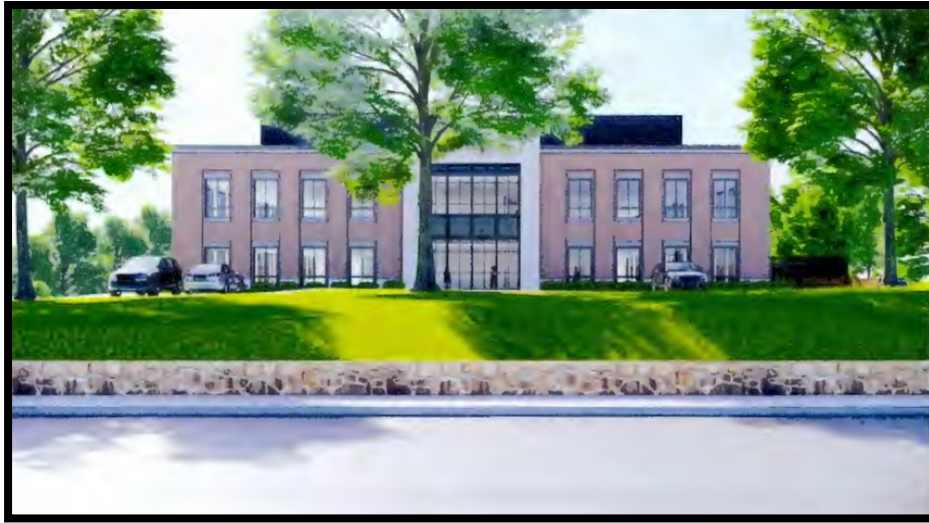
Proposed new Norfolk & Dedham Insurance Corporate Building