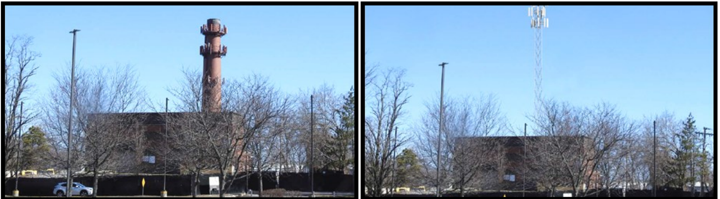
Existing Town of Dedham incinerator smokestack and ZBA approved new Town of Dedham wireless communications tower, located at 5 Incinerator Road

The Zoning Board of Appeals voted 5-0 on July 19, 2020 in favor of the Town of Dedham’s proposal to demolish the existing incinerator smokestack at 5 Incinerator Road and replace it with a new cellular tower. The new 195 ft. wireless cellular tower would allow the continuation of existing wireless services located on the smokestack and provide an opportunity to expand the Town’s Fire and Police Department’s communications capabilities.